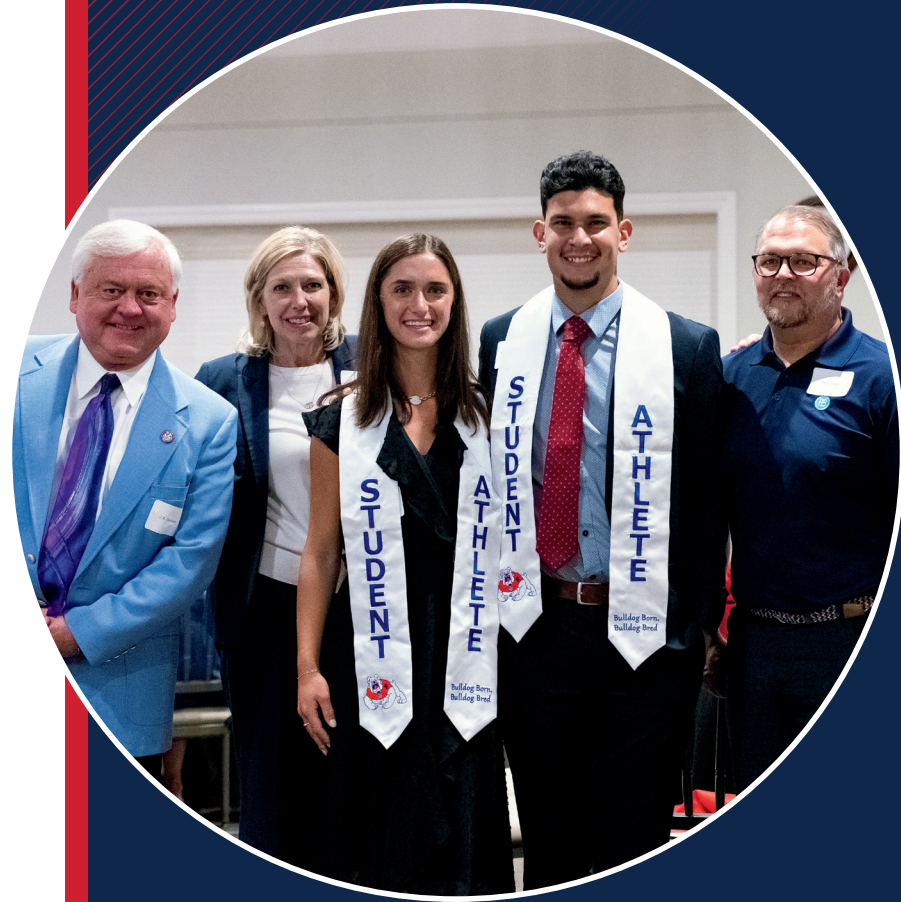
Student-athletes received their graduation stoles at the 2023 Donor Appreciation Dinner.